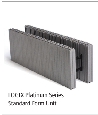
LOGIX Platinum Series Standard Form Unit